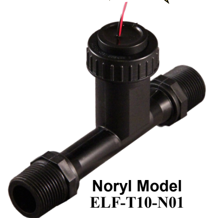
Noryl Model ELF-T10-N01

Backed by CSTs LIFETIME No hassle WARRANTY on flow sensor inserts