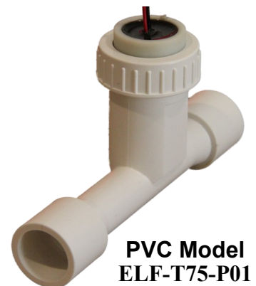
PVC Model ELF-T75-P01

Backed by CSTs LIFETIME No hassle WARRANTY on flow sensor inserts